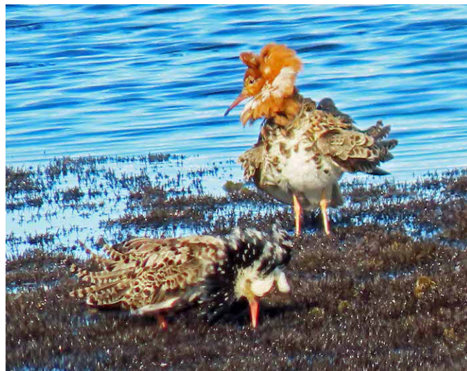
Two Male Ruffs