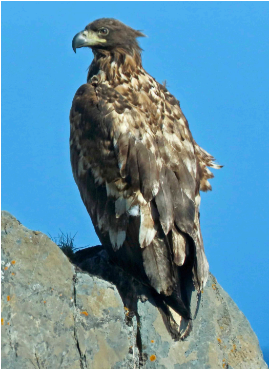
White-tailed Eagle on rocks by Barents Sea

Hundreds of bird species nest and raise their chicks in the Arctic. Recently, I joined a group of 5 other birders plus 3 guides to see these birds in Finland and Norway. We spent 2 weeks traveling by van north of the Arctic Circle and saw over 200 species, plus spectacular scenery, a lot of snow and ice, tiny quaint villages and a few mammals including lots of reindeer. Which species was most interesting? Definitely a type of shorebird called a Ruff. The males develop wonderfully colorful and fluffy plumage during the breeding season and bow and posture to impress the females. Enormous White-tailed Eagles were also impressive to see, especially noticeable on the rocks along the edge of the Barents Sea.